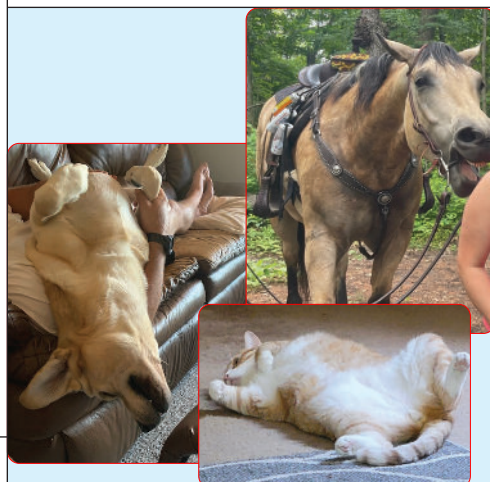
Nuvera recently held a pet contest internally to raise money for local animal shelters. Employees could pay to cast their votes for their favorite pets and these are our winners in three categories: Hank (dog), Chester (cat) and Hotshot (other).

In 2023, Nuvera will perform similar improvements to our business website, nuverabusiness.com . ♦