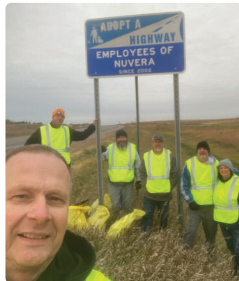
Nuvera's Adopt-A-Highway crew helped keep Minnesota beautiful, cleaning up our stretch of Hwy 15 near New Ulm in mid-October.