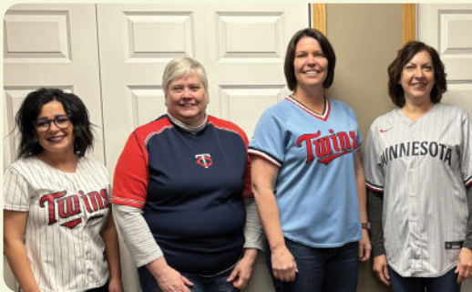
Nuvera employees dressed up in their favorite Twins gear to celebrate the home opener on April 3, 2025!

Minnesota Twins fans can now watch all the action on MLB and Twins TV, both included in Nuvera's Entertainment digital TV tier! Don't miss a single play. Watch in standard or high definition!